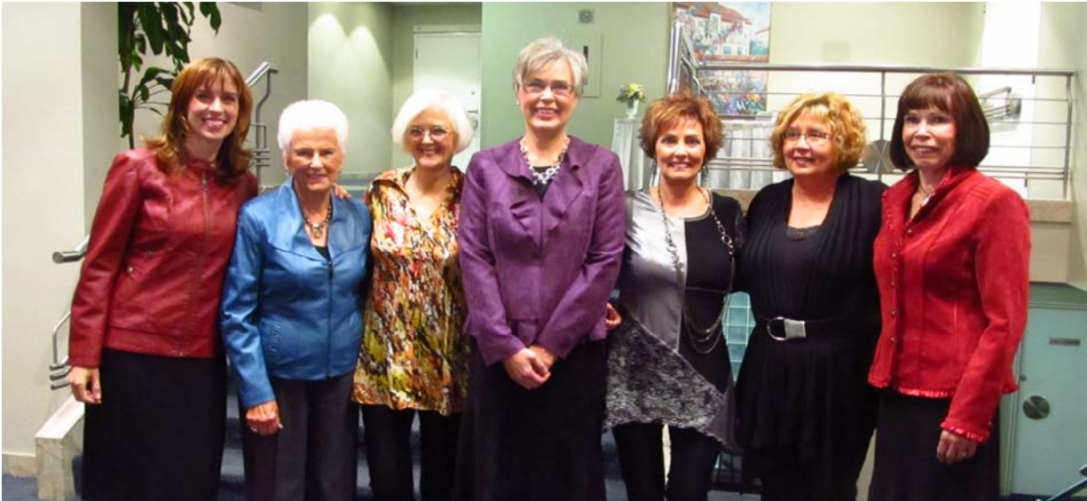
Our lovely models, waiting for their turn on the catwalk at our September Fashion Show.

It's been a busy fall at the ACGA. Here are some of the things keeping us busy: